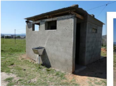
Helwel Trust funded toilet block

UCCC is a volunteer run service near St Augustine's, between Dundee and Nqutu. The volunteers provide community support services to up to 100 families including a feeding scheme for orphans and vulnerable children, a pre-school, an older ladies support group to combat loneliness, home-based care to children and families suffering from HIV/AIDS and a community garden.