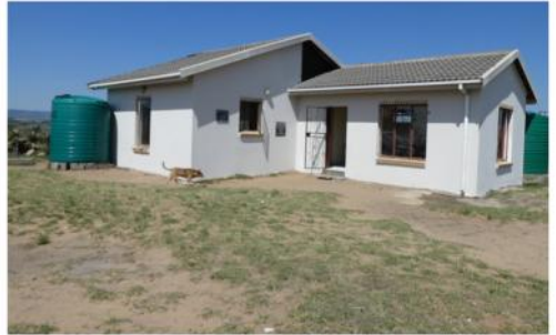
Helwel Trust funded Barker Building with water tank

We have supported them for a number of years with funds for a building, drainage, freezers and fencing and toilets, which we saw in operation. We were greeted enthusiastically by members of the committee and volunteers. It is impressive to see such vigour and motivation from volunteers who are seeking to support the neediest of their neighbours. They report that their services and number of people seeking support are growing.