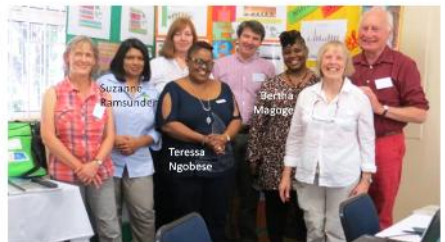
Team at TREE HQ