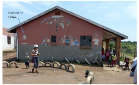
Ntambanana—Chloe Sharp Pre-school